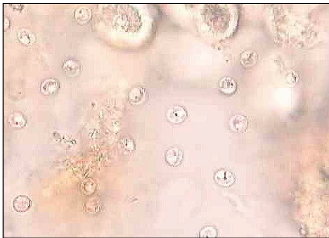
Oocysts of Cryptosporidium from fecal flotation